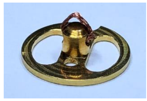
Fig. 3: 3D puck calibration fixture, showing the copper braid extended to optimize the contact area made with the calorimeter platform.

Additionally, the gold-plated silver calibration fixture (4091-624) for the 2D puck is also not compatible with the 3D puck. The user kit for the 3D puck includes its own calibration plug (4085-283) which has a small length of a woven copper braid. Installing this for field calibrations is not trivial, as care needs to be taken to ensure adequate thermal contact. First, using a thin wooden toothpick, pull the loop of copper braid away from the post so as to create a small loop, as depicted in Fig. 3.